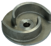
Stainless Steel Impeller